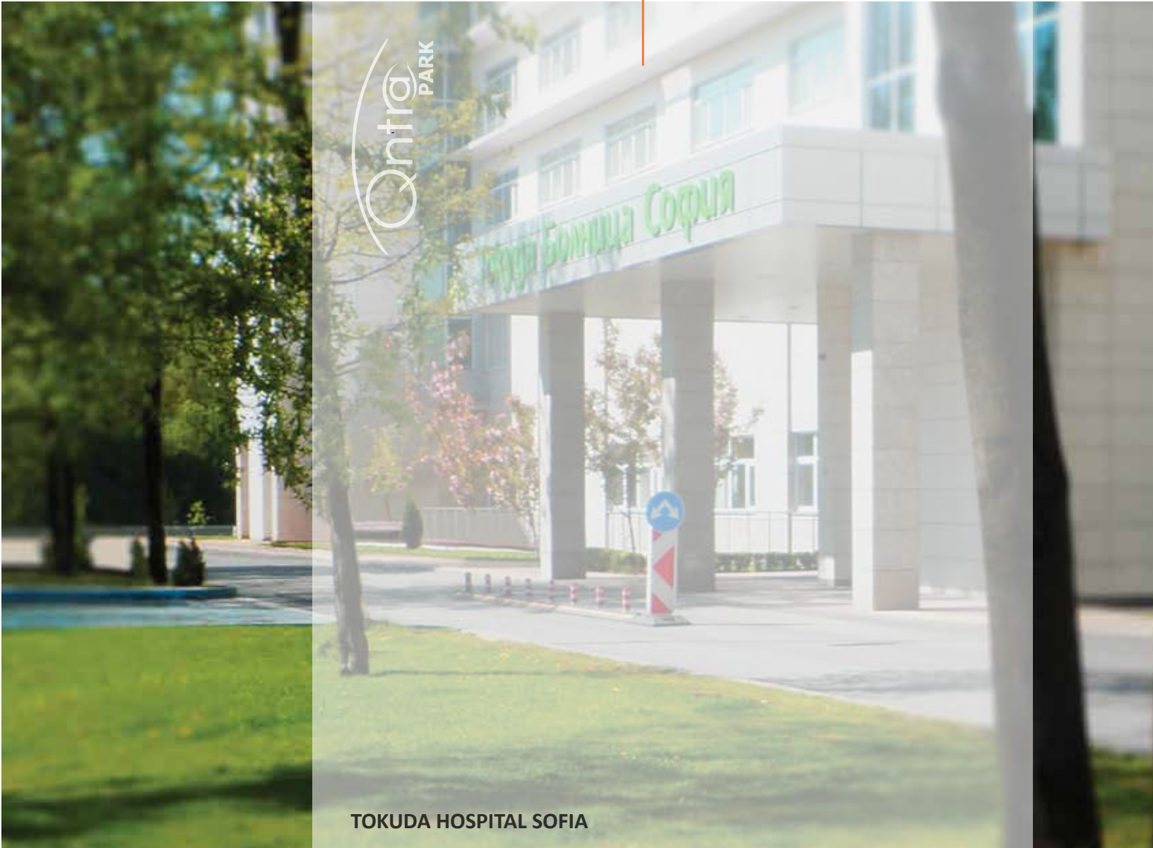
TOKUDA HOSPITAL SOFIA