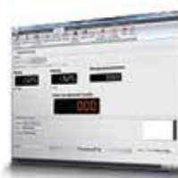
MANAGEMENT SOFTWARE QPS PARK